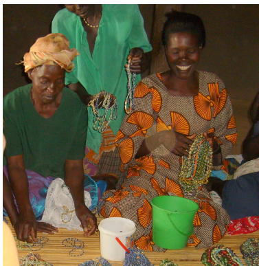
Ugandan women, 2009 AFJN trip